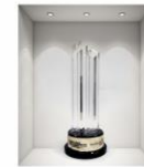
IDC Digital Transformation