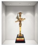
World Education Summit 2017

The award winning Smartclass content @ your HOME!