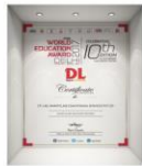
World Education Summit 2017