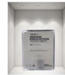
Indian Education Awards 2017